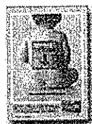
Journal Ad (PDF)

FeverAll® The Only Brand of Acetaminophen in Suppository Form What's a parent to do when a child can't tolerate oral fever relief products because of vomiting, nausea, bad taste or irritability? Or when allergies to additives in liquids are a problem? The answer is FeverAll® Acetaminophen Suppositories — fighting fever like no other product available.